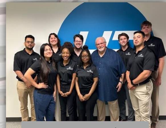
Current MIT Class

*As we expand into various countries, possessing a work visa for employment in other countries will be taken into consideration for promotions/transfer opportunities.