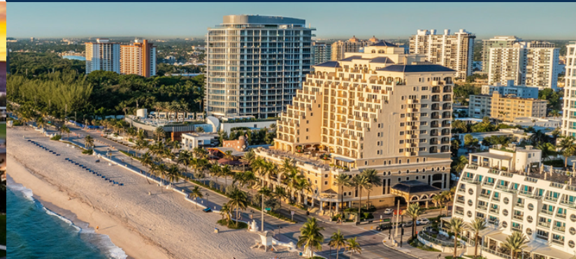
The Atlantic Hotel & Spa - Ft. Lauderdale, FL