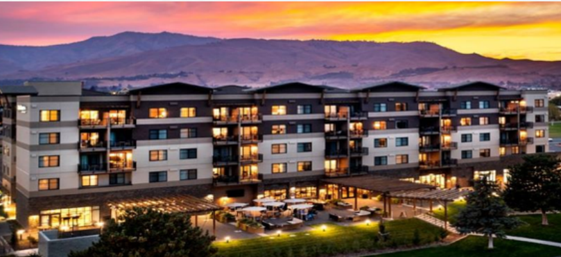
Residence Inn - Wenatchee, WA