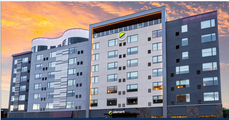
SpringHill Suites & Element - Colorado Springs, CO