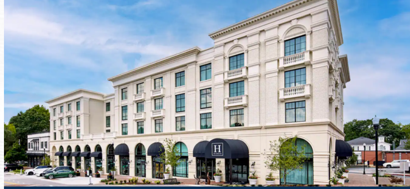
The Hamilton Curio Collection - Alpharetta, GA