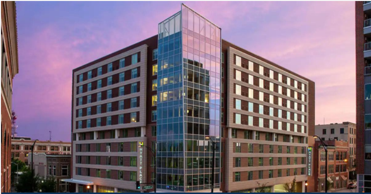
Hyatt Place - Champaign/Urbana, IL