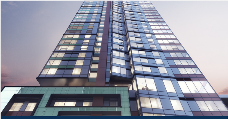
The Sound Hotel Tapestry Collection - Seattle, WA