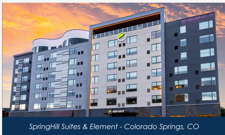
SpringHill Suites & Element - Colorado Springs, CO