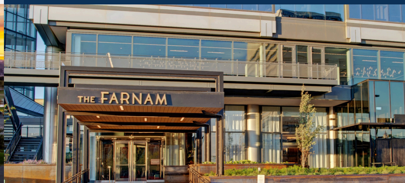
The Farnam, Autograph Collection - Omaha, NE