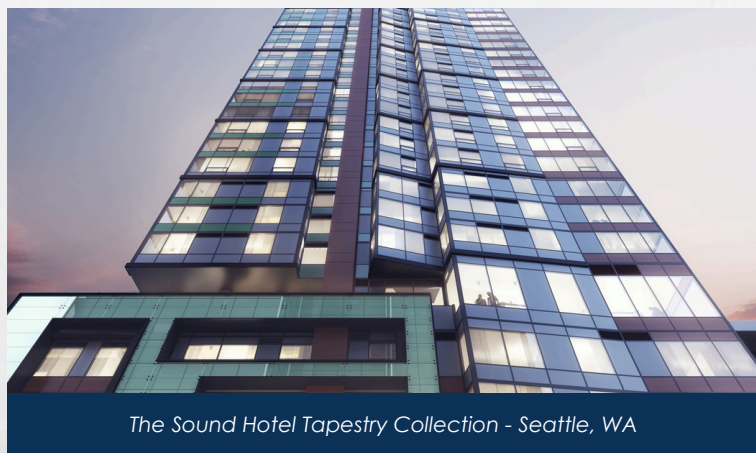
The Sound Hotel Tapestry Collection - Seattle, WA