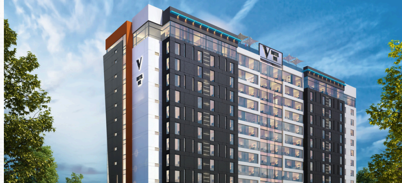
Curio Collection - Toronto/Vaughan, ON (In-Development)