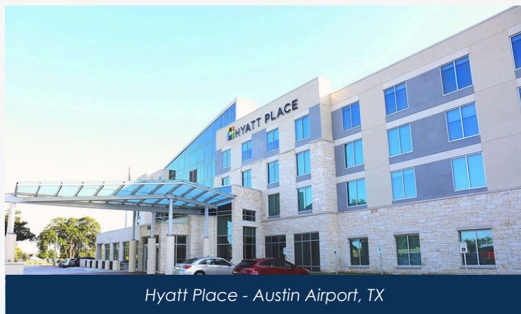
Hyatt Place - Austin Airport, TX