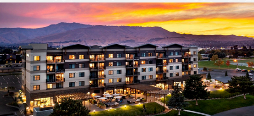
Residence Inn - Wenatchee, WA