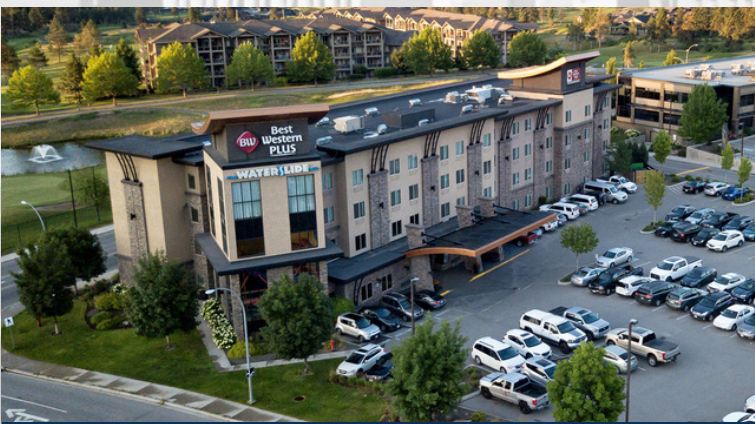
Best Western Plus - Wine Country, West Kelowna, BC