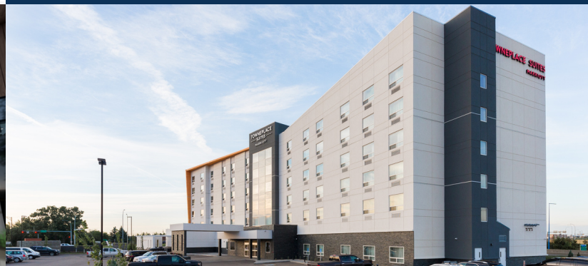
TownePlace Suites - Edmonton South, AB