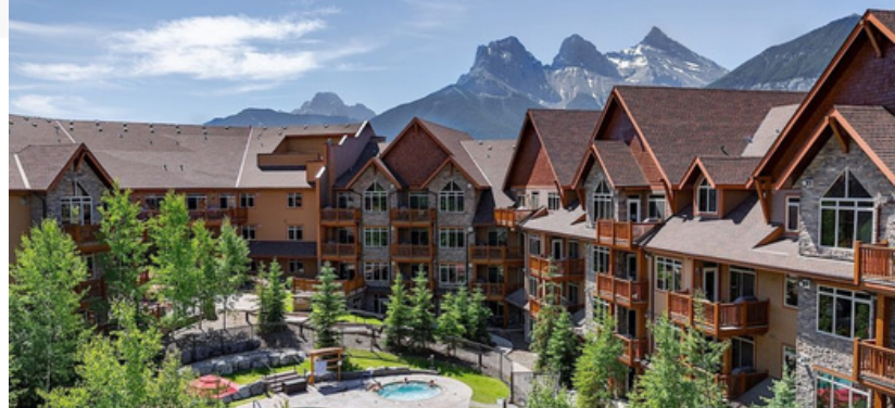
Stoneridge Mountain Resort - Canmore, AB