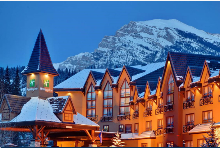
Holiday Inn - Canmore, AB