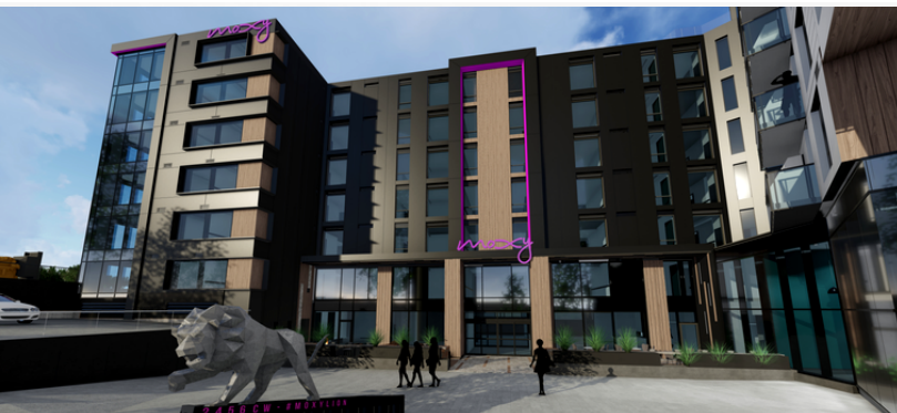
Moxy - Halifax, NS (In Development)