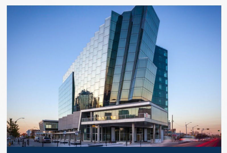
DoubleTree Downtown Edmonton - Edmonton, AB