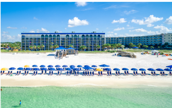
On Island Time – Pg. 6