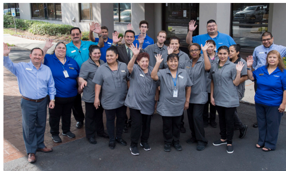
Houston’s Renovation – Pg. 5