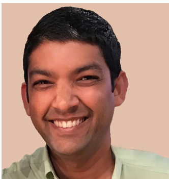
“Get to Know a GM!” – Pg. 4