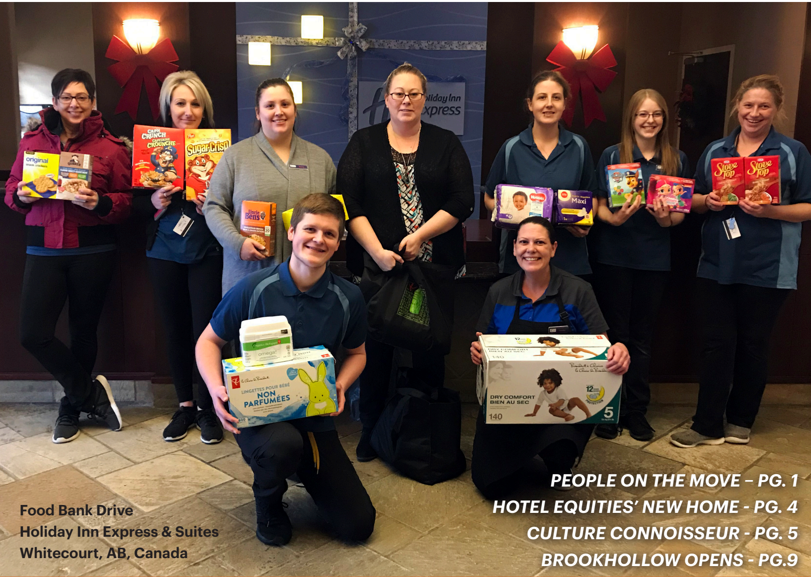
Food Bank Drive Holiday Inn Express & Suites Whitecourt, AB, Canada