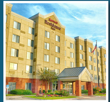
Additions in Texas – Pg. 7