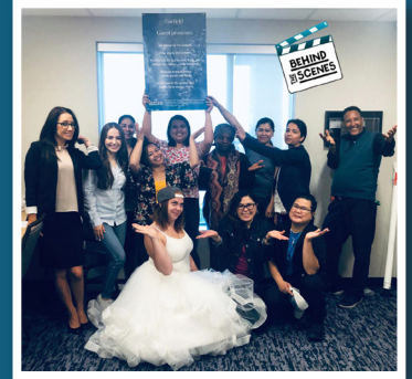
Now Open in Edmonton! – Pg. 6