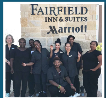
International Housekeepers Week – Pg. 8

30 th Anniversary Coach's Corner – Pg. 3