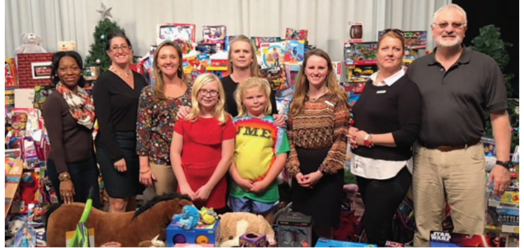
The Charleston, SC hotels collected and delivered over 400 toys for Toys for Tots!

The Life Lessons Over Lunch group's "Not Your Office Christmas Party" at HE's corporate headquarters in Atlanta, GA!