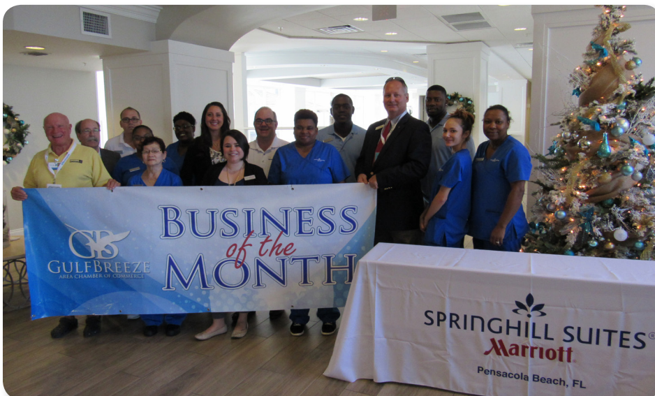
The SHS by Marriott Pensacola Beach team proudly receives their Business of the Month banner.

During the recent renovation, the hotel donated furniture to Habitat for Humanity. Annually, it hosts several fundraisers, including ArtNight to benefit a local elementary school art program.