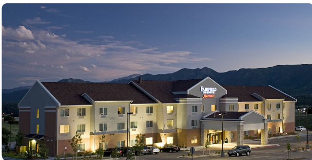
Fairfield Inn & Suites by Marriott Colorado Springs North