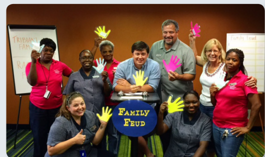
iCARE in the Community continued on page 6