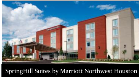
SpringHill Suites by Marriott Northwest Houston

Hotel Equities was chosen to manage a one-of-a-kind SpringHill Suites by Marriott under construction on the Northwest Freeway in Houston's growing medical and business corridor.