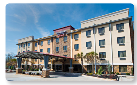
Fairfield Inn & Suites Gainesville, GA

Programing focused on driving purpose, culture and strong results at the property and corporate levels. HE leaders from throughout the country attended content-specific ses-