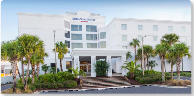
Revenue Generation Hotel of the Year: SHS Pensacola Beach

otel Equities recently celebrated its most successful year to date at its annual conference. In 2016, the firm's hotels posted record performance in all key measurable areas. The firm hailed outstanding achievements and honored top individuals and hotels with awards for excellence in both leadership and results.